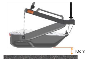
Figure 2. Air measurement mode

Measure the tow ball height of your vehicle and refer to Figure 4 to select correct orientation of height adjustment tower based on your tow ball height. Assemble the complete unit using the provided M12x40 bolts with washers and nut according to Figure 3.