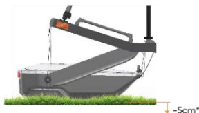
Figure 1. Ground measurement mode